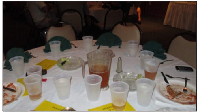
BYK Team (camera shy)