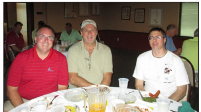
MF Cachet Team