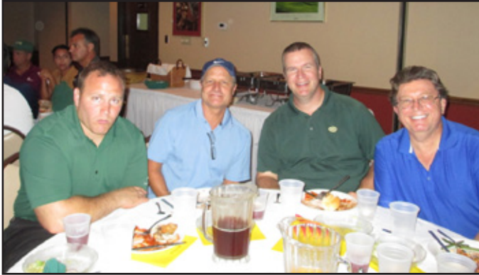
Lanxess / Bayer Team