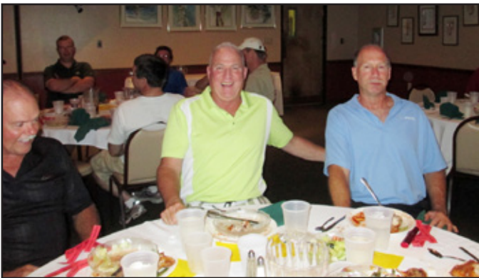
Elementis Team ( half the team! )