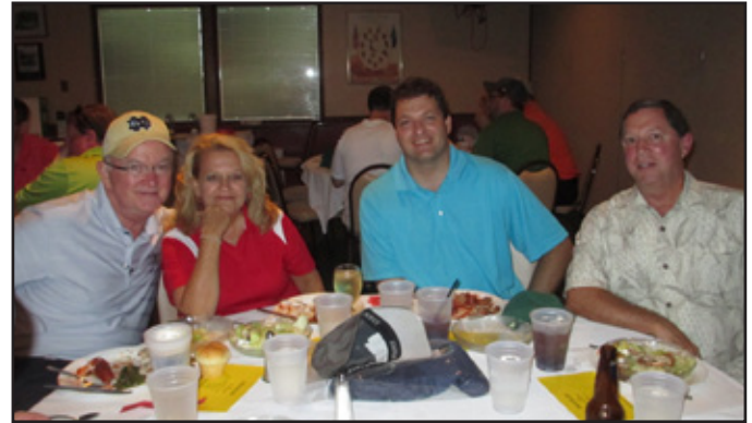
Durr Marketing Team