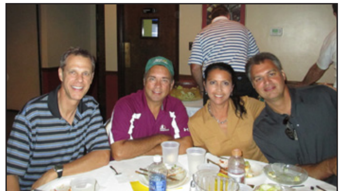
Ranbar / Cary Company Team